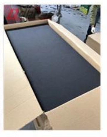
7 QC & Packing

Tel:+86-15192680619 Email:info@qdboss.cn