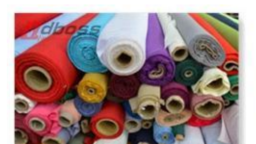
A1 Original Fabric