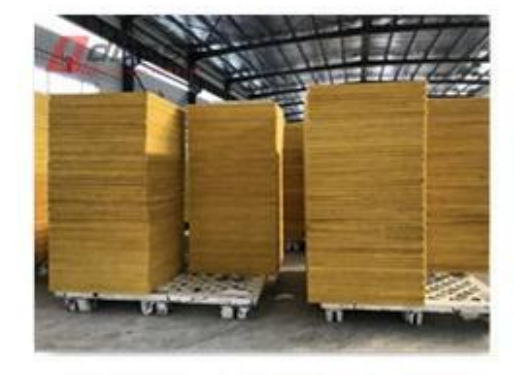
B1 Original fiberglass panel