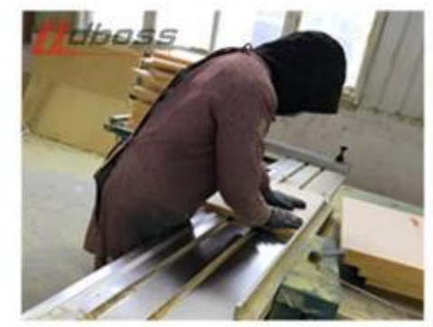
B2 Cutting different sizes/shapes B3 Resin curing & Air drying