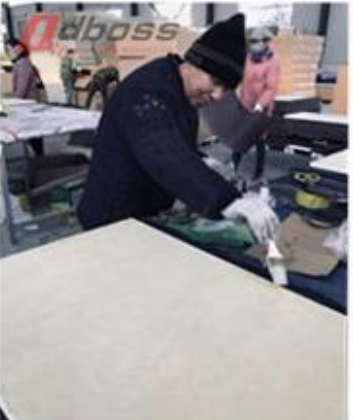
5 Apply the eco-friendly glue on the fiberglass panel