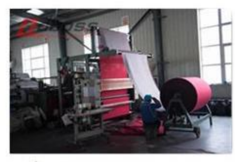
A2 Flame-retardant treatment