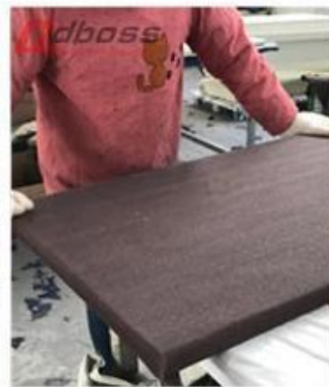
6 Wrap the fabric