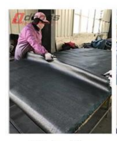
4 Fabric cutting